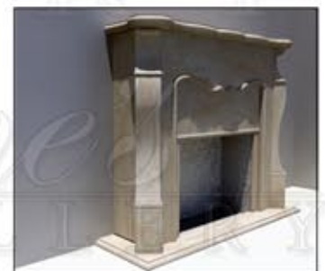
After (mantel applied)